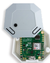
C209 tag reference board